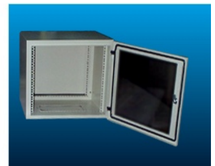
• 180° opening hinges.