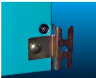
• Wall mounting bracket