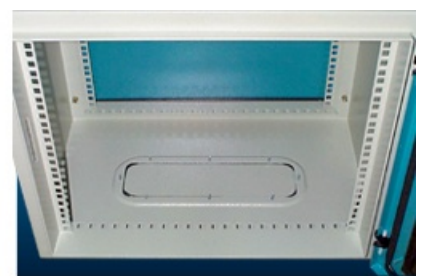
• Gasketed cable-glands.